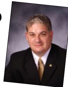
Photo & article clip taken from The Daily Journal online archive titled "EPA takes a closer look at St. Joe State Park" dated August 22, 2007

local representative would be very much welcomed.